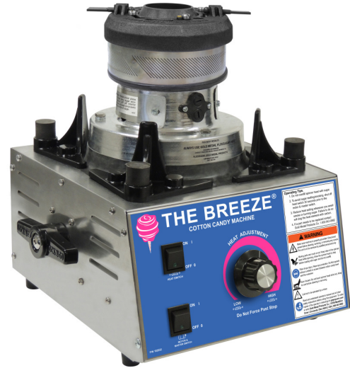
Unit view without Floss Pan